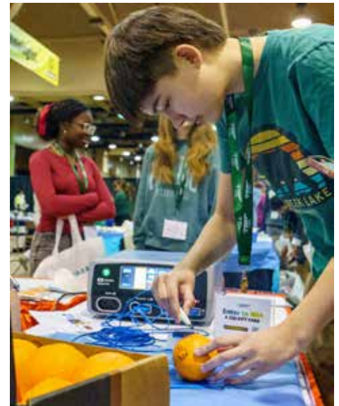
Hands-on career exploration at the 2025 Central Ohio Healthcare Summit.

HCCOCO also continued to convene the region through the Central Ohio Healthcare Summit, reinforcing the collaboratives' role as a hub for employer engagement, student outreach, and sector alignment. Collectively, these efforts position HCCOCO as a leading model for how coordinated employer leadership can strengthen healthcare talent pipelines and connect education to employment across Central Ohio.