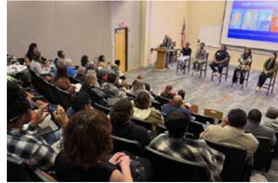
A packed house to learn about the AMP revamp.

Together, these efforts position AMP as a streamlined support system for young people navigating early career decisions and a reliable talent pipeline for Central Ohio's most in-demand industries.