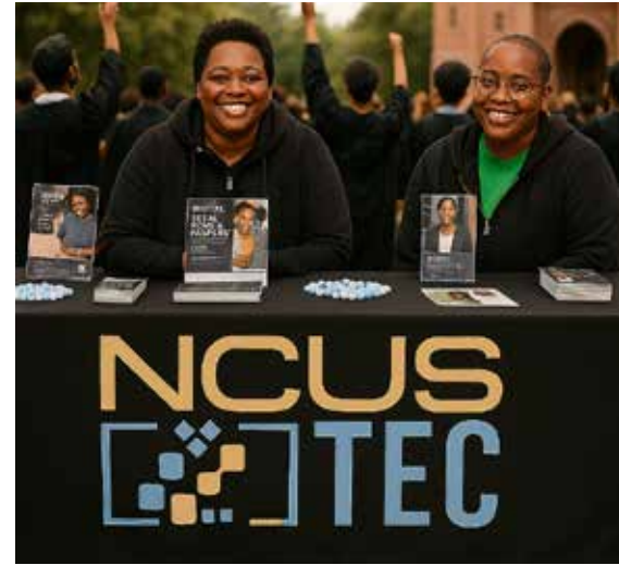
Training providers meet with prospective students at one of many in-person event opportunities.

In person hiring events, one-on-one career coaching, a variety of workshops and resources provide the region a full spectrum of job training and talent acquisition services reaching thousands of job seekers and hundreds of employers. Aspyr's emphasis on continuous improvement and accountability ensure that the regions workforce needs are addressed and remain innovative, accessible, relevant, and impactful.