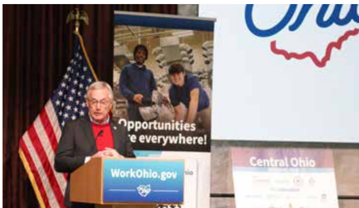
Lt. Gov Tressel announced Aspyr as the Central Ohio regional hub of WorkOhio.

At the same time, Aspyr deepened its investment in emerging talent by redesigning the Achieve More and Prosper (AMP) program to better align youth services with high-growth industries. Together, these efforts reflect Aspyr's continued focus on building a connected, accountable workforce ecosystem that supports individuals, strengthens businesses, and sustains Central Ohio's long-term competitiveness.